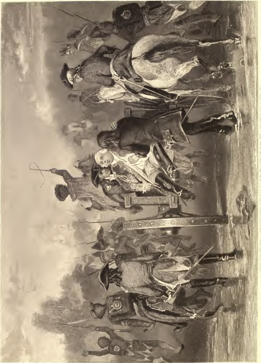
Illustration of a group of people, including men, women, and children, traveling across a landscape. Some are on horseback, some are on foot, and some are carrying large bundles or packs. The scene is set outdoors with a cloudy sky and a distant horizon.